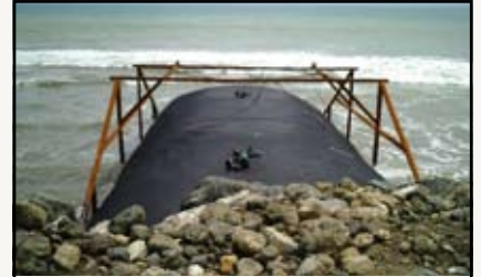
TenCate Geotube® system being held in place by steel frame as it is filled.

TenCate Geotube® systems also allows great versatility in construction. Because units can be custom sized to various lengths and circumferences, less material may be needed. Also, because TenCate Geotube® systems can be filled quickly in place, construction time can be reduced dramatically.