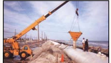
TenCate Geotube® system being filled with sand using a hopper.

In fact, one of the advantages of TenCate Geotube® systems is that the gentle original slope of the beach can be recreated. This improves the aesthetics of the shoreline and also aids wildlife by providing a natural-seeming habitat—and blocking lights from shore that can confuse sea turtles and other creatures.