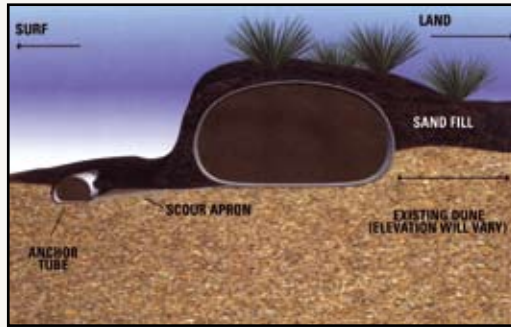
TenCate Geotube® system sand dune cross section.

In many coastal areas, temporary permits are now in place that allow immediate installation of TenCate Geotube® systems to protect homes that are in danger.