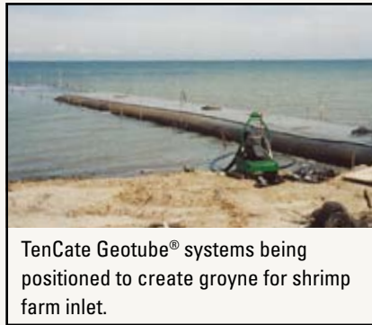
TenCate Geotube® systems being positioned to create groyne for shrimp farm inlet.

Because TenCate Geotube® systems can be custom sized, groyne applications can be designed for optimum performance. TenCate Geotube® systems can be filled with sand from the area when allowed, simplifying the construction process. If regulations require fill material to come from another location, the units can still be filled less expensively than other construction methods.