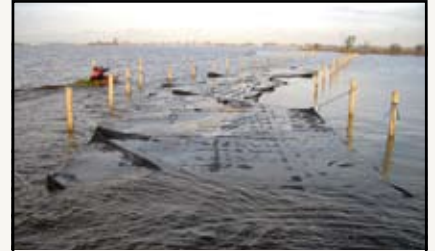
TenCate Geotube® system ready to be filled with sand.

Better yet, birds and other wildlife find the exposed TenCate Geotube® systems ideal places to rest, sun and fish.