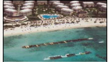
TenCate Geotube® system placed offshore for use as a breakwater.

TenCate Geotube® systems can be placed offshore in areas where wave action is causing damage. The units disrupt the water flow and waves, and the size and location of the structures can be engineered so as to encourage beach replenishment by the altered waves now reaching the beach. Many communities have added yards of shoreline with the simple, inexpensive installation of TenCate Geotube® system installed offshore.