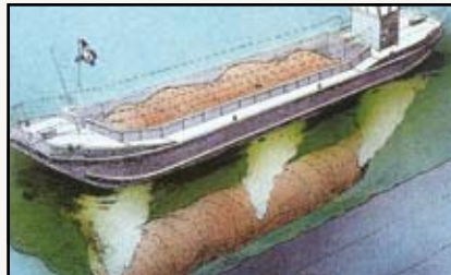
TenCate Geocontainer ® system being dropped from split bottomed barge.

TenCate Geocontainer ® systems are used for underwater structures, can create dikes, closures, contain dredge spoils or other materials, or change water and wave action.